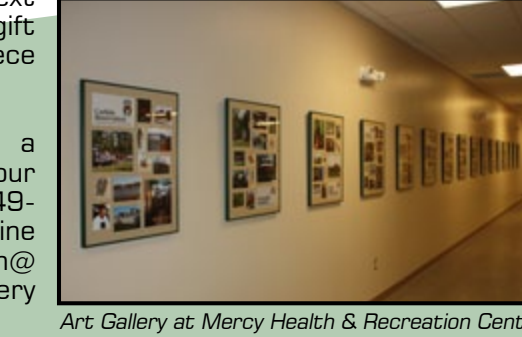
Art Gallery at Mercy Health & Recreation Center

Interested in becoming TrueNorth Artist? Contact our Gallery Manager at (440) 949-5200 ext. 227 or send online portfolio samples to tnorth@ metroparks.cc Attn. Gallery Manager.